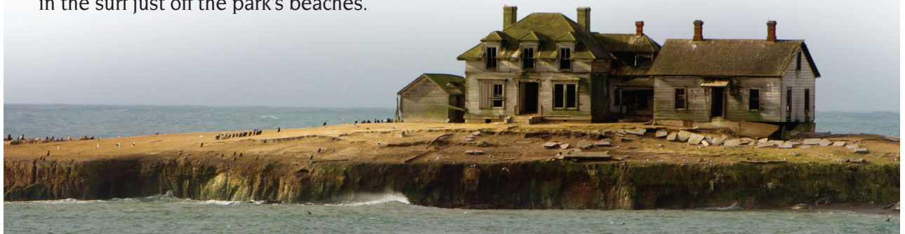
Año Nuevo Island is home to an abandoned lighthouse station, birds, and many pinnipeds.

Tide pools at Año Nuevo teem with more than 300 species of invertebrates, some quite rare. Common life forms include clams, abalone, limpets, hermit crabs, and anemones. Nutrients from seal and sea lion waste fertilize the lush aquatic plant growth that feed the rockfish and bottom fish offshore.