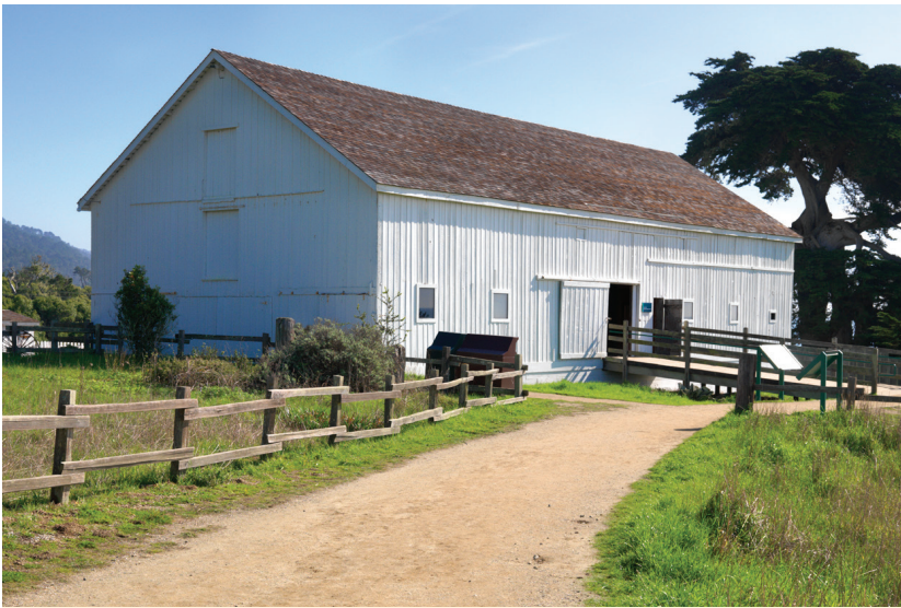
Marine Education Center

Año Nuevo Island's first elephant seals arrived in 1955; the first pup was born there in 1961. Males hauled onto the mainland in 1965, and the first known mainland birth came ten years later. The number of elephant seals breeding and giving birth on the mainland still grows. Since their protected status began, elephant seals continue to multiply. Their breeding range extends as far north as Point Reyes.