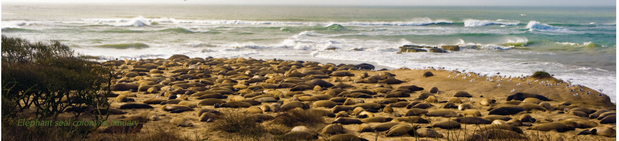
Elephant seal colony in January

After World War II, the dairy industry changed. Row-crop farming took the place of dairy cattle, thanks to new irrigation technology. Segments of the Monterey cypress windbreaks that the farmers planted still survive.