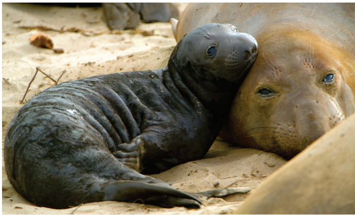
Elephant seal pup with mother